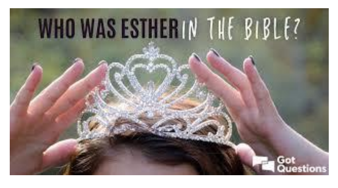
Let's find out together!

Everyone is welcome to be a part of a Small Group. They meet on the 1<sup>st</sup> and 3<sup>rd</sup> Tuesdays of the month. You can attend at noon in the Chapel, bring a sack lunch, or at 7 pm at the Shaw's house, snacks will be served.