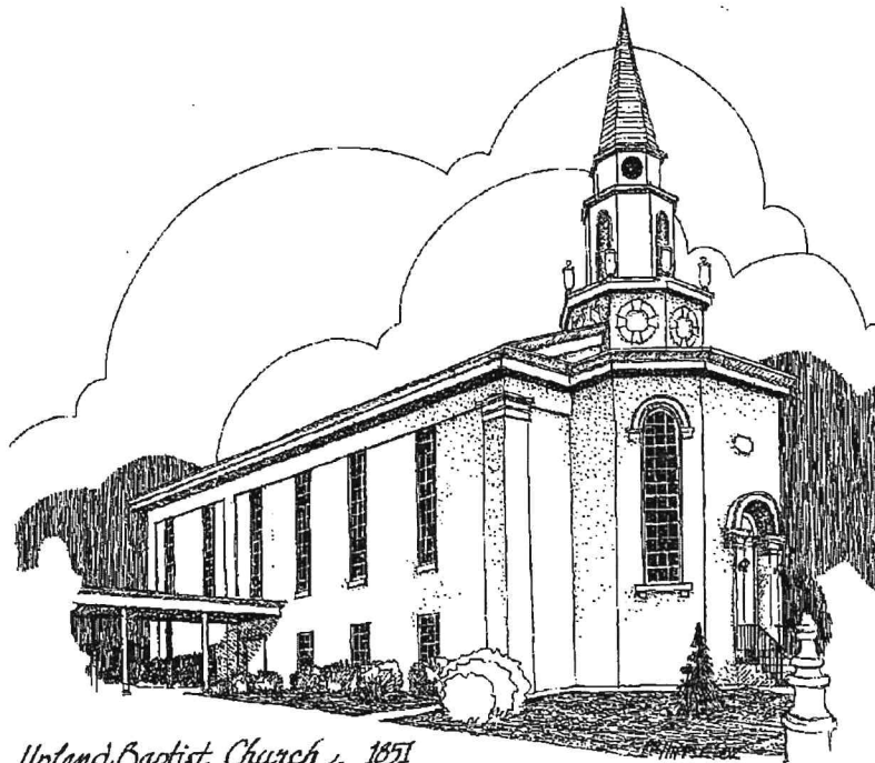
Upland Baptist Church, 1851

325 Main Street Upland, Pennsylvania 19015 610-874-7474 uplandbaptist@verizon.net www.uplandbaptist.org